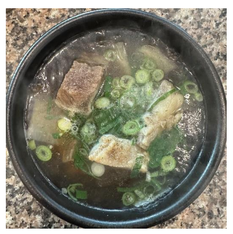
< Galbitang 갈비탕 >

Ttukbaegi Bulgogi 뚝배기불고기 Beef bulgogi with vegetables in hot soup Add a bowl of brown rice £3.5 Add a bowl of white rice £2.5