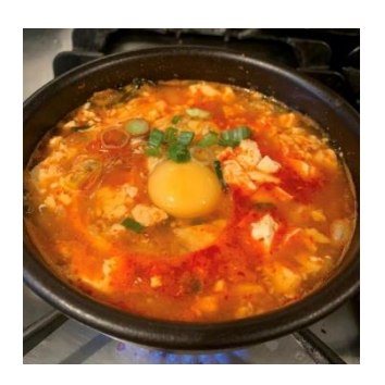
< Spicy soft tofu soup 순두부찌개 >